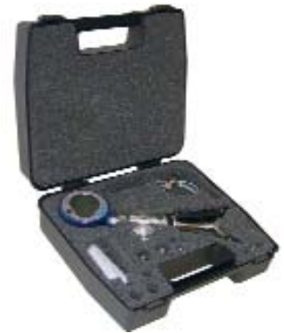
Pneumatic test kit