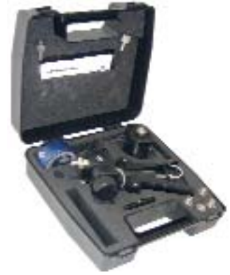
Pneumatic and hydraulic test kit