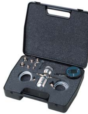
Low pressure pneumatic test kit

Includes DPI 104-IS; ranges to 10,000 psi (700 bar), PV 411A combined pneumatic and hydraulic test pump, hydraulic reservoir, hose, adaptors, seal kit and case