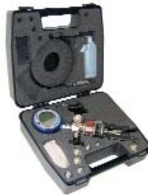
Hydraulic test kit